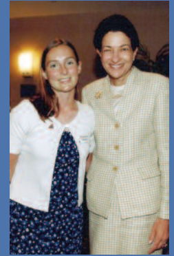
Hon. Hillary Clinton (D-NY) and Hon. Olympia Snowe (R-ME) participated in OFA's Capitol Hill media events.